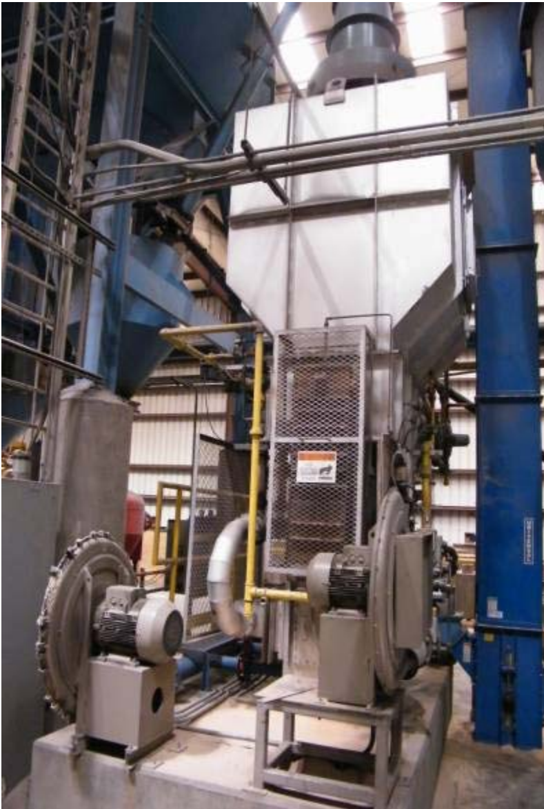
transfer box end