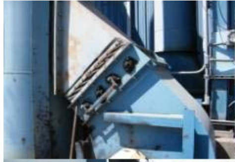
above pic shows motorized louvered assembly on dust collector fan.

Also included in the price.....one dust collector removed from production, as is, bought for the thermal system.